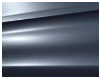
Iron Grey (pearlescent)