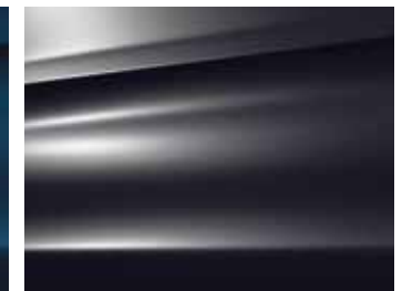
Gunmetal (metallic) 2