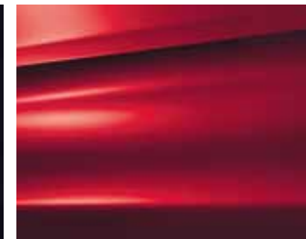
Passion Red 1