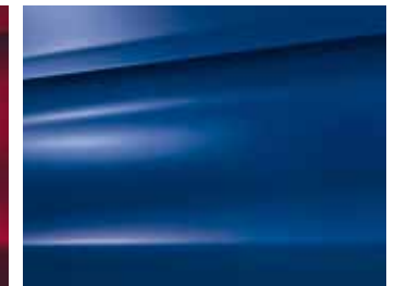
Pacific Blue 1