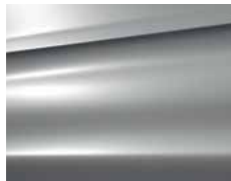
Arctic Steel (metallic)