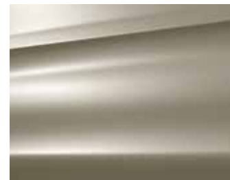
Golden White (metallic) 2