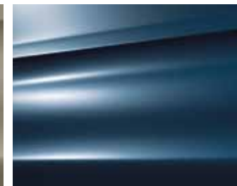
Kyanos Blue (metallic) 2